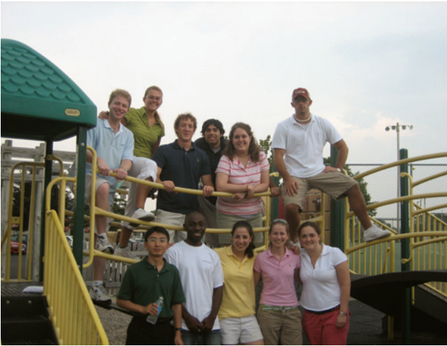
The interns enjoy a picnic after the Actuarial Golf Scramble.

“My experience as an intern showed me the different types of work that actuaries do. I learned I was interested in the profession and wanted a career as an actuary.”