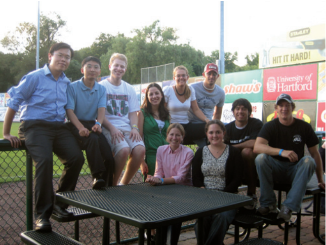
Hartford Life’s interns take in a New Britain Rock Cats baseball game.

“The greatest asset to my professional development at The Hartford has been the numerous opportunities to network. I have been able to meet a large portion of the actuarial community and develop valuable contacts for the future.”