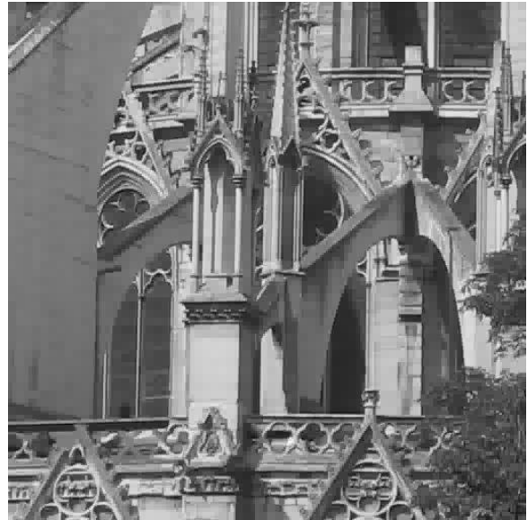
FIGURE 7. Normalized, 10:1 Compression