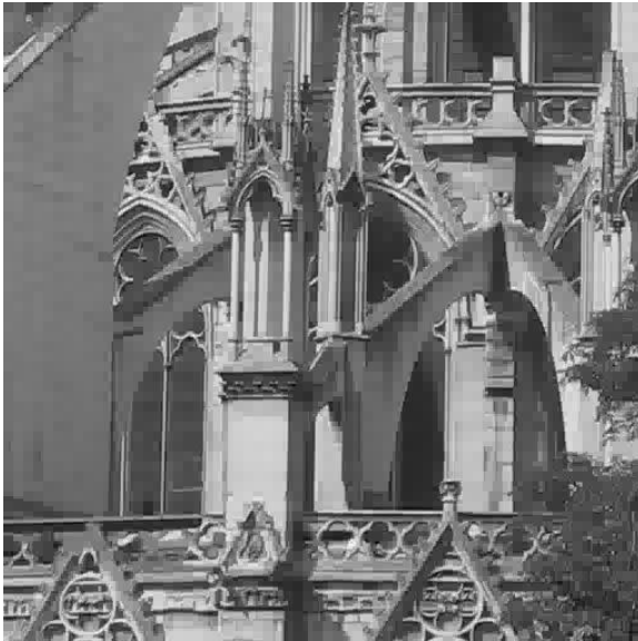
FIGURE 6. Standard, 10:1 Compression

The two images below represent a 10:1 compression using the standard and normalized Haar wavelet transform. Notice that the rounded and angled sections in the normalized image are of a higher quality.