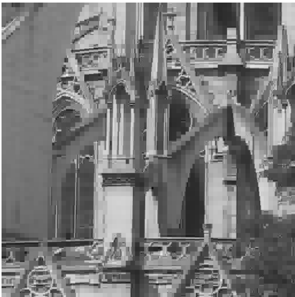
FIGURE 4. 30:1 Compression Ratio