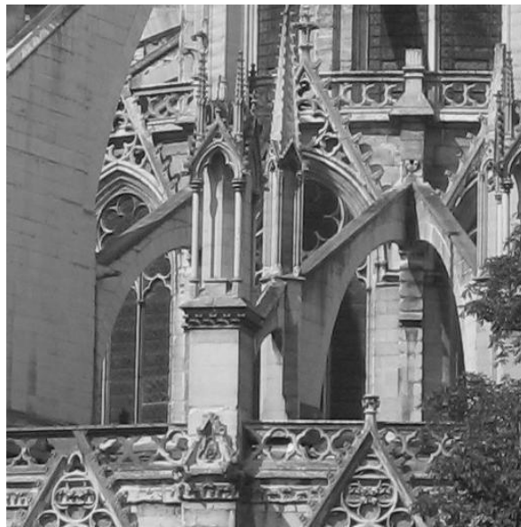
FIGURE 1. Flying buttresses of Notre Dame de Paris

Below is a 512 \times 512 pixel grayscale image of the flying buttresses of the Notre Dame Cathedral in Paris: